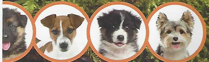
Shepherd Dog Russell Terrier Australian Shepherd Biewer Terrier